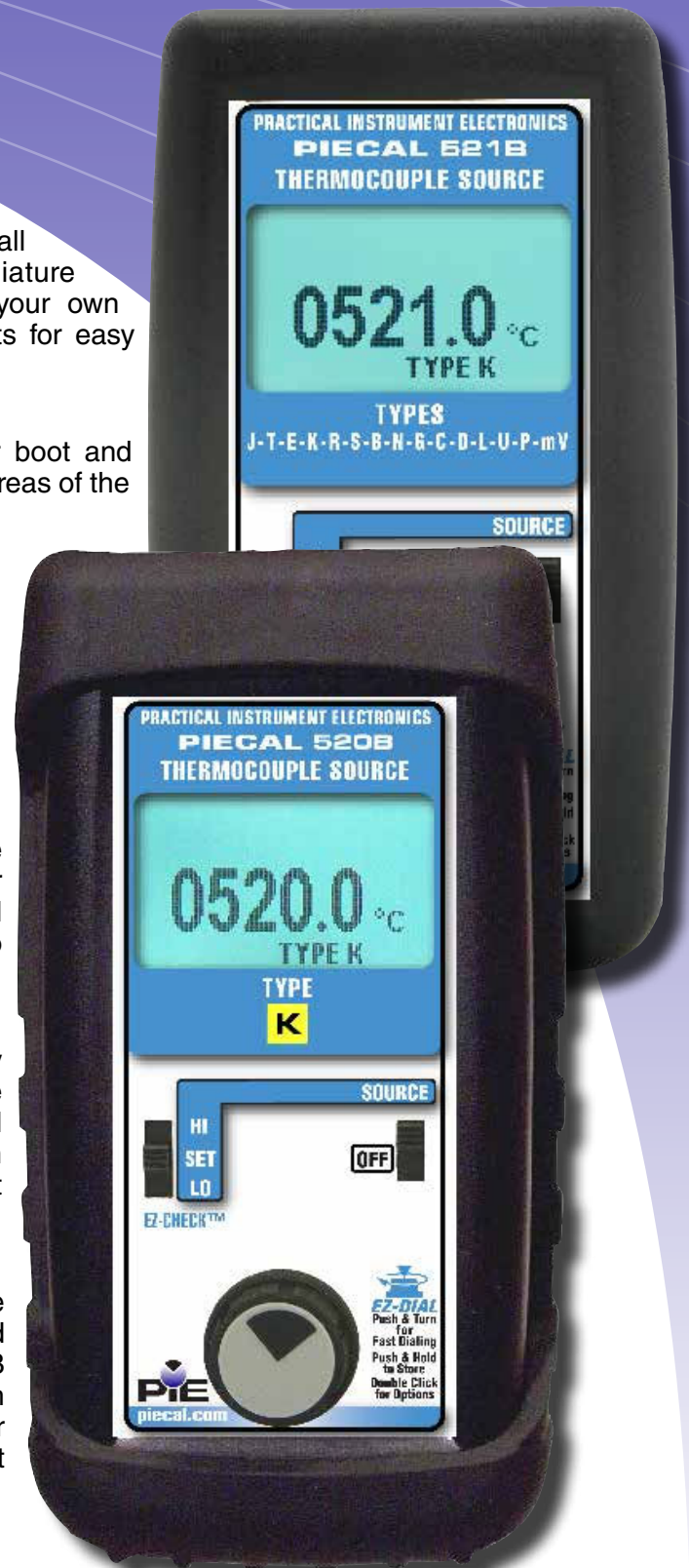
Actual Size (Shown with optional boot)